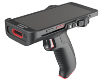
CT37 with Scan handle

The CT37 wearable solution is a purpose-built wearable accessory that provides highly efficient hands-free operations. The wearable solution is designed for maximum user comfort and easy swapping between workers. The CT37 device can also be easily removed from the wearable holder and used alone for in-store or other applications.