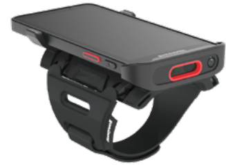
CT37 Wearable solution for a hand-free

The CT37 is armed with the latest FlexRange FR bright green dot laser, which is more visible at long distance and under strong sunlight than devices configured with red dot laser. It brings long range scanning performance found in industrial devices to lightweight, pocketable devices like the CT37. The ultimate in flexibility, FlexRange enables virtually every scanning use case in a single, compact device without compromising range or speed, enabling businesses to focus on fewer device types to manage.