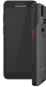
The CT37: 5G mobile computer on the Mobility Edge™ platform, elegant, slim, powerful, durable, and easy to use.

Reliable performance, data connectivity, and communications for frontline mobile workers, the CT37 is an all-purpose hand-held device tool to keep business workflows moving and operations flowing. Combined with powerful software including Operational Intelligence, Smart Talk communications, Smart Pay, and more, the CT37 is the ideal platform on which users in retail, healthcare and delivery can build effective solutions.