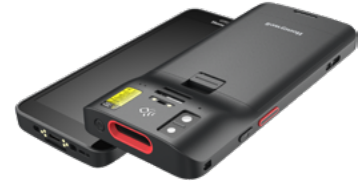
CT37: 5G mobile computer on the Mobility Edge™ platform, elegant, slim, powerful, durable, and easy to use.

The CT37 also comes with the latest 5G and Wi-Fi 6E technology to stay connected in both indoor and outdoor environments. 5G offers the highest bandwidth and lowest latency available for frontline workers. Whether you are on a private 5G or CBRS network, or a Wi-Fi 6E environment, your networks can continue their workflows with reliable uptime.